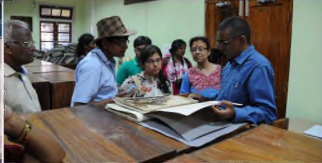
Professors and Research Scholars from Universities of Calcutta and Burdwan at Herbarium, ANRC