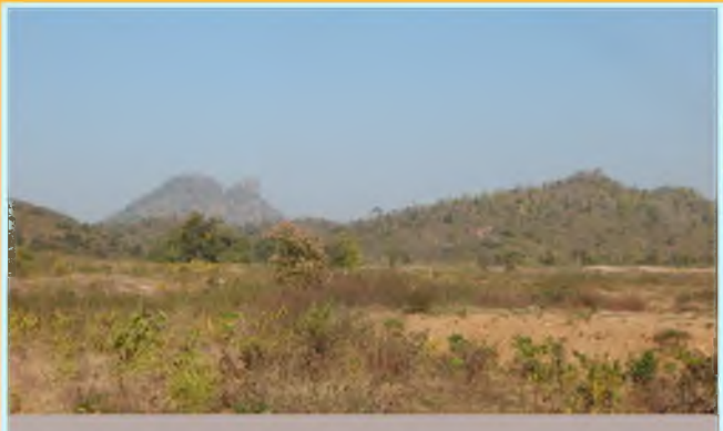
Bagai forest through which the proposed Railway Corridor will pass