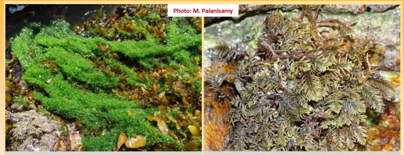
Chaetomorpha crassa tangled with Sargassum sp.