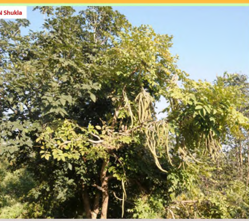
Radermachera xylocarpa (Bignoniaceae) – a threatened species from Raigarh district of Chhattisgarh