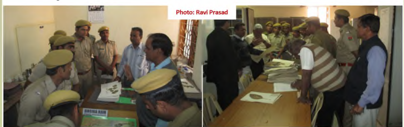
AZRC staff explaining about processing of specimens to forest guard trainees

Sri D.P. Sharma, PCCF (Research), Jaipur along with 2 staff members of Forest Trainee Institute, Jodhpur and 18 forest guard trainees visited on 11.02.2016.