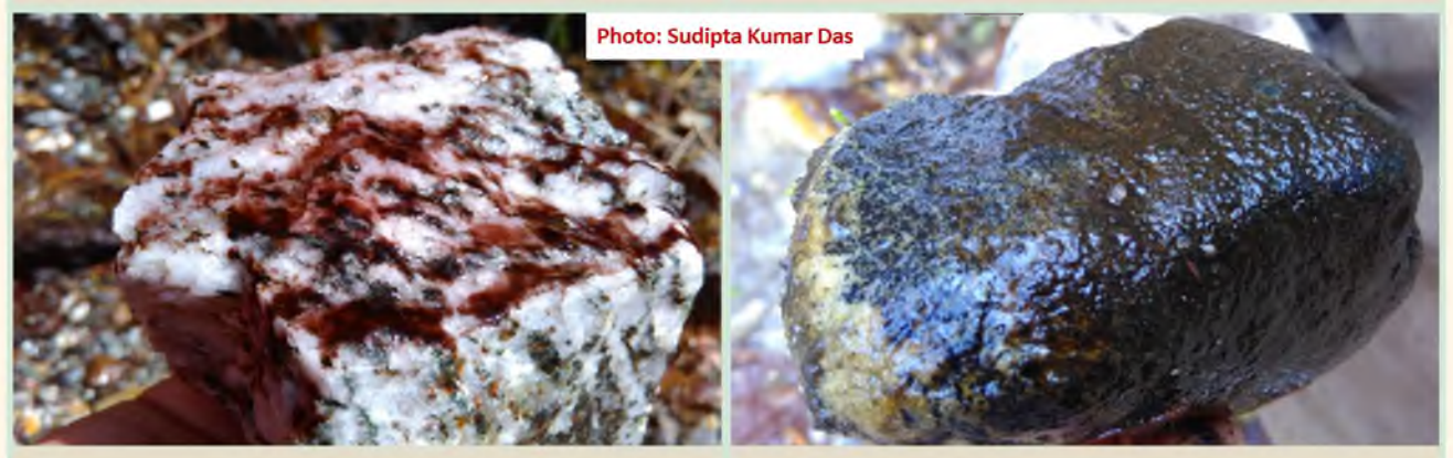
Growth of Phormidium on a moist rock