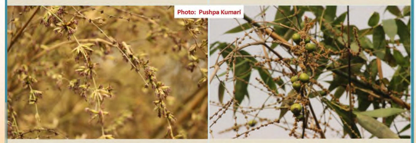
Bambusa vulgaris (Poaceae: Bambusoideae) in flowering