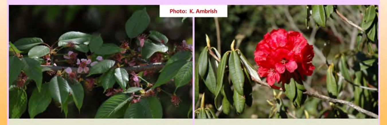
Prunus cerasoides blooming in Chakrata

Scanned and digitized 107 specimens of the family Capparidaceae and of Pteridophytes.