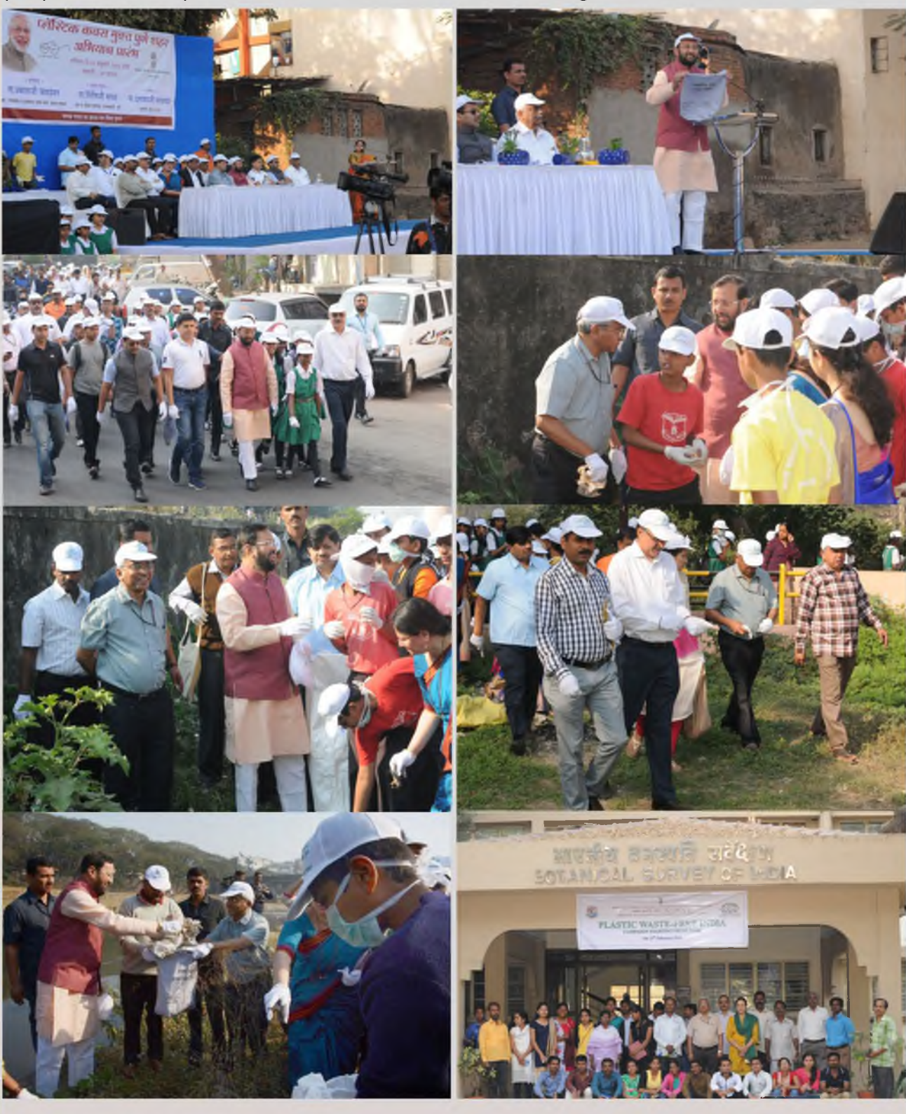
Plastic Waste-free campaign at Pune, launched by Sri Prakash Javadekar, Hon'ble Union Minister for Environment, Forest & Climate Change and participation of Western Regional Centre

The scientists of WRC, Pune participated in the campaign on 'Plastic Waste-Free Pune' launched on 13.02.2016 by Sri Prakash Javadekar, Hon'ble Union Minister of State (I/C) for Environment, Forest & Climate Change at DES's New English School, Ramanbagh School, Pune. The Western Regional Centre, Pune took initiatives in creating awareness about 'Plastic Waste Free Pune' campaign by printing banners and posters for displaying in WRC office campus and experimental garden at Mundhwa. The Plastic Waste-free pamphlets were also printed and distributed to the schools and colleges.