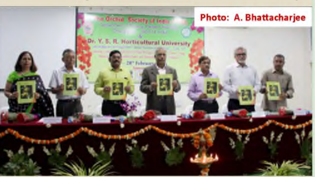
Release of 'The journal of the orchid society of India' during the conference of the Orchid Society