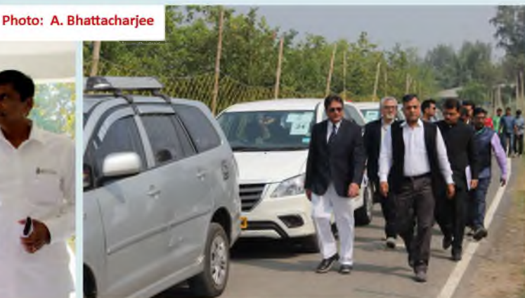
Secretary, MoEF & CC, Directors, BSI & ZSI along with the Members of Consultative Committee of Members of Parliament visiting Jharkhali, Sunderbans