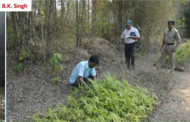
Plant Saplings procuring from Forest Nursery, Agartala