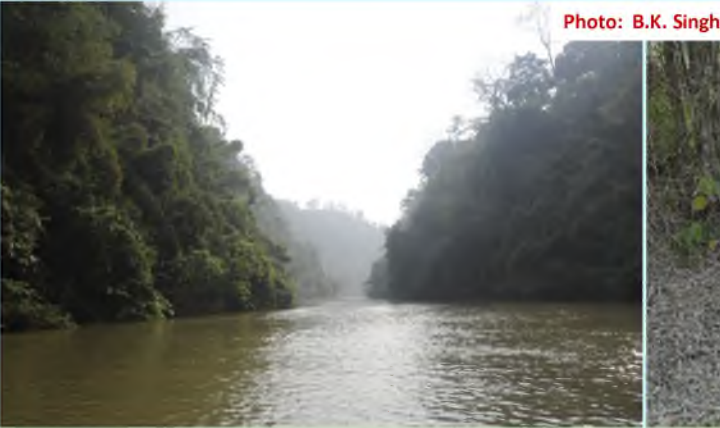
Lush green vegetation along Gomati River, Tripura