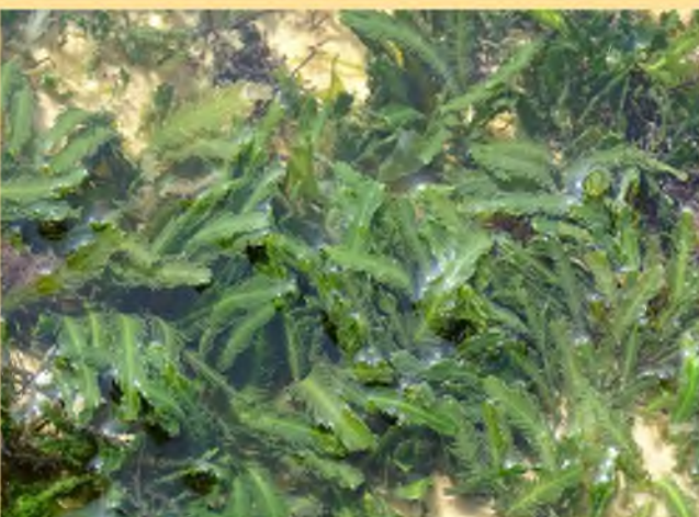
Caulerpa sertularioides (seaweed) at Karnataka coast