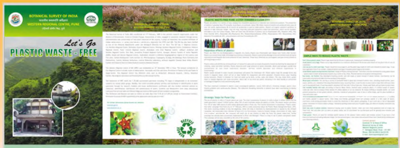
Plastic Waste-free pamphlet distributed to the schools and colleges in Pune by Western Regional Centre