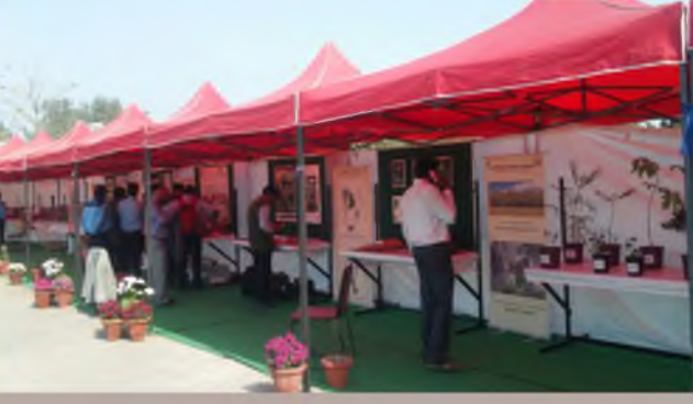
A view of stall at BGIR, Noida during the Annual Flower Show 2016