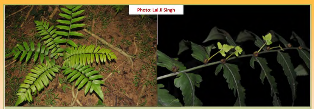
Diplazium proliferum reported for the first time from India based on collection from Little Andaman