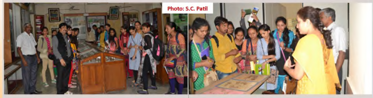
Students visiting museum at WRC