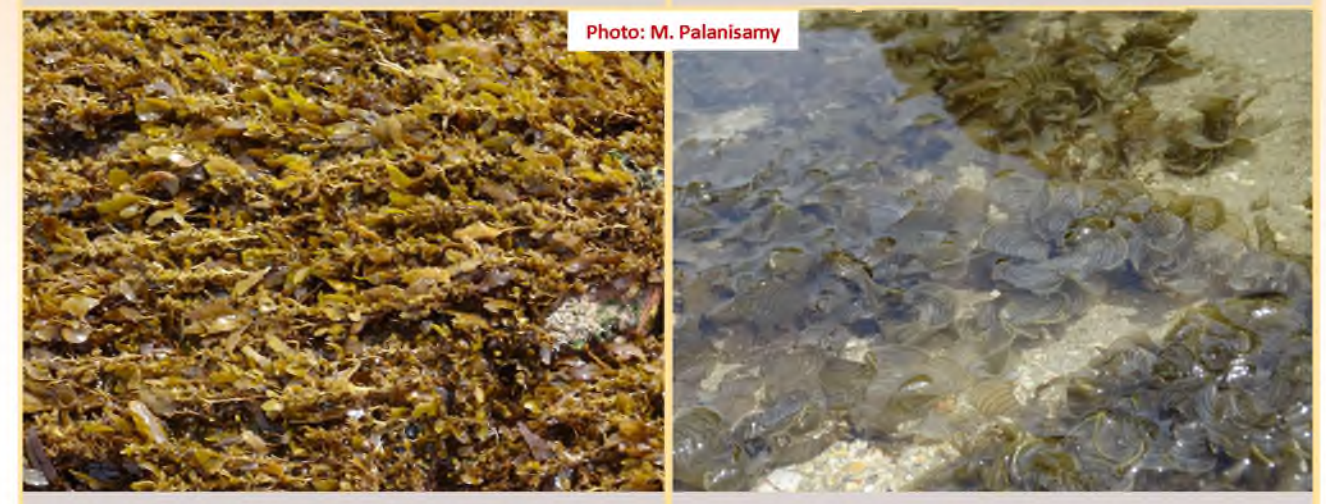
Luxuriant growth of Sargassum ilicifolium