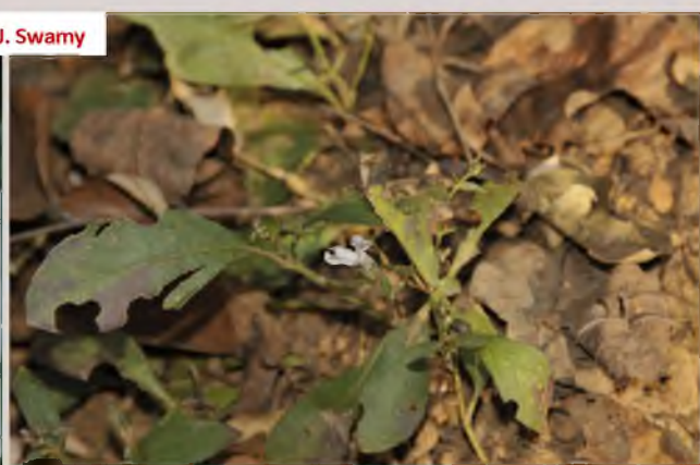
Andrographis beddomei from Isukagundalu Sacred Grove, Prakasam district, Andhra Pradesh